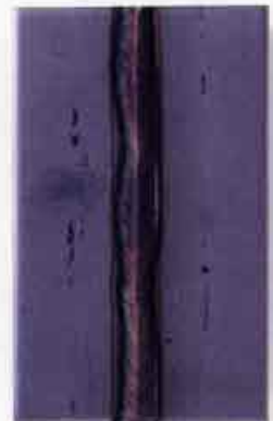
AS WELDED Automatic-GTAW