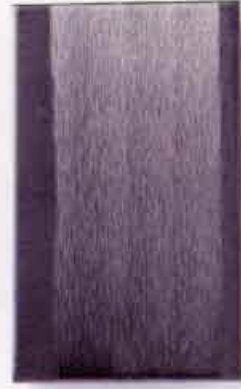
180 GRIT FINISH