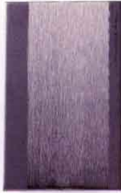
150 GRIT FINISH