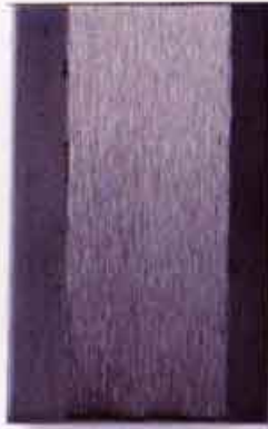
80 GRIT FINISH