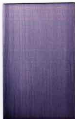
320 GRIT FINISH 320 grit re-polish over 240 grit pit free.