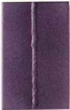
GLASS BEAD Manual-GTAW