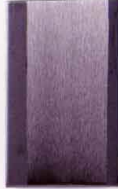
240 GRIT FINISH