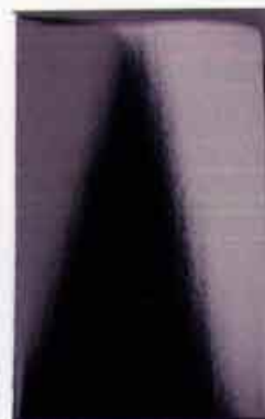
ELECTROPOLISH Grade #1 320 Grit Finish

Since 1955, DCI has been fabricating stainless steel processing vessels for the worldwide industries of: Dairy and Food, Beverage, Brewery, Chemical, Pharmaceutical, and OEM.