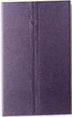
GLASS BEAD Automatic-GTAW