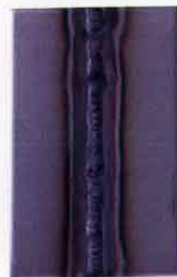
AS WELDED Manual-GTAW

GTAW - Gas Tungsten Arc Weld GMAW - Gas Metal Arc Weld