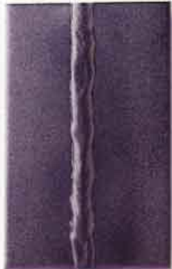
GLASS BEAD Manual-GMAW