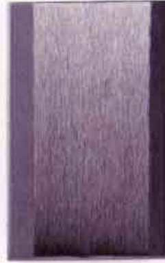
120 GRIT FINISH