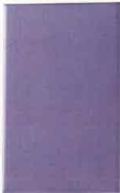
2B MILL FINISH General purpose cold rolled finish (7 ga. or lighter).