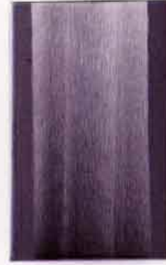
320 GRIT FINISH