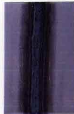
AS WELDED Manual-GMAW