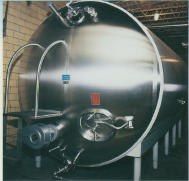
Examples of vessels utilizing CIPA-H.